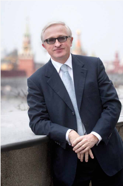
President of the RSPP Alexander Shokhin