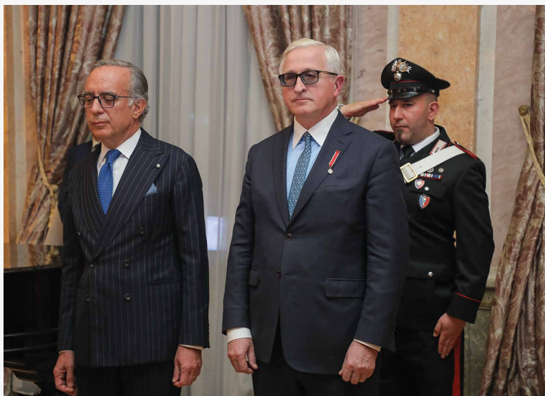
Ambassador of Italy to Russia Pasquale Terracciano awarding A. Shokhin The Order of the Star of Italy